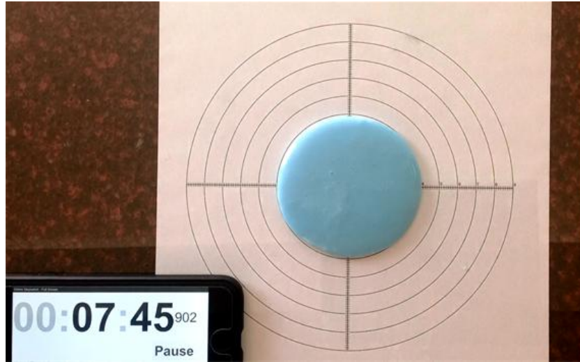
Figure 1. Screen shot of paused video [2] of spread of slime for collecting data with which to compare a modeling result.

(s) and area of the slime circle (estimated from the radius using the tick marked axis on the polar grid lines) in centimeters ( \text{cm}^2 ).