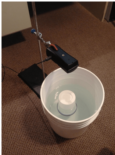
Figure 2. Apparatus for collecting data on the vertical motion of a floating container.