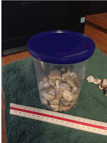
Figure 1. Container partially filled with small stones for weight and used in the collection of the data.