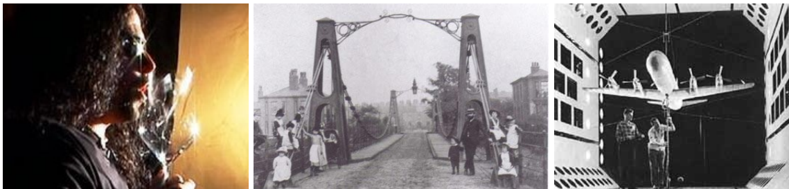
Figure 1. MythBusters: Breaking Glass (Discovery Channel) (L); Broughton suspension bridge (rebuilt in 1883) (C); NASA: a powered model of the Lockheed Electra mounted in the transonic dynamics tunnel. (R)

On September 29, 1959, a commercial Braniff airline, a Lockheed L-188 Electra, crashed after 23 minutes into the flight. The officials determined that the left wing had failed, but they could not determine the cause of the catastrophe. Six months later a second Electra aircraft crashed on March 17, 1960, with its right wing found 5 miles from the crash site [5]. NASA, Boeing, and Lockheed engineers determined that violent flutter had torn the wings off the two planes. They were able to duplicate the flutter in wind tunnel simulations [6]. The weakened engine mounts would develop the propeller-whirl flutter. The fatal resonance could build up and tear the plane apart in 30 seconds.